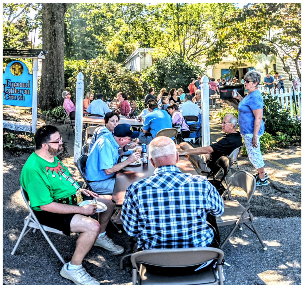
(Church picnic Emanuel courtyard 2019

Emanuel Church Picnic after worship at Emanuel @ ~11:30AM bouncy house, corn hole, good food, fun, friends