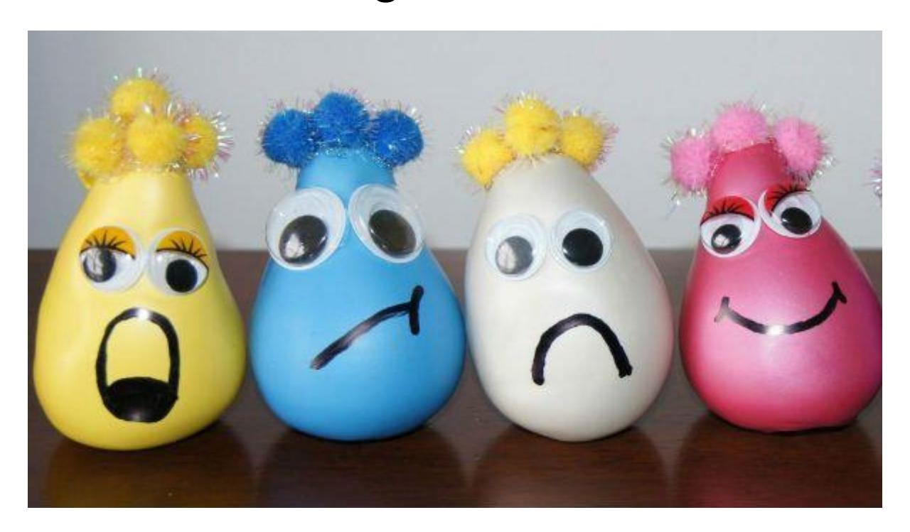
Tuesdays at 6:30PM in the Fellowship Hall

Come help make crafts to sell at Emanuel's Fall Bazaar table.